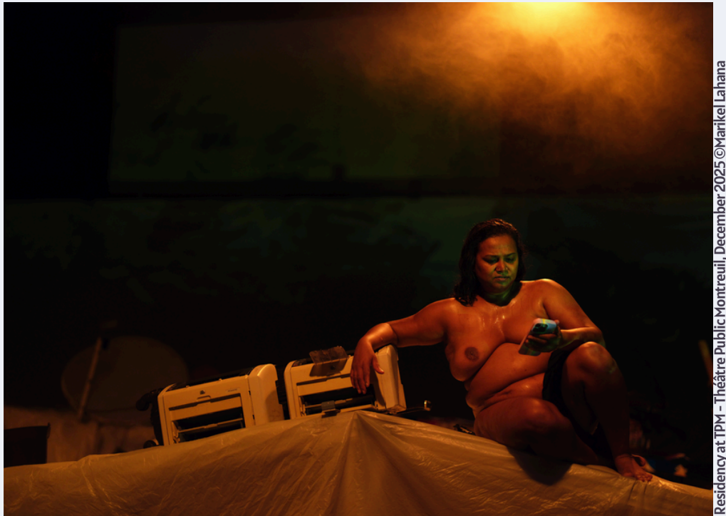
Residency at TPM - Théâtre Public Montreuil, December 2025