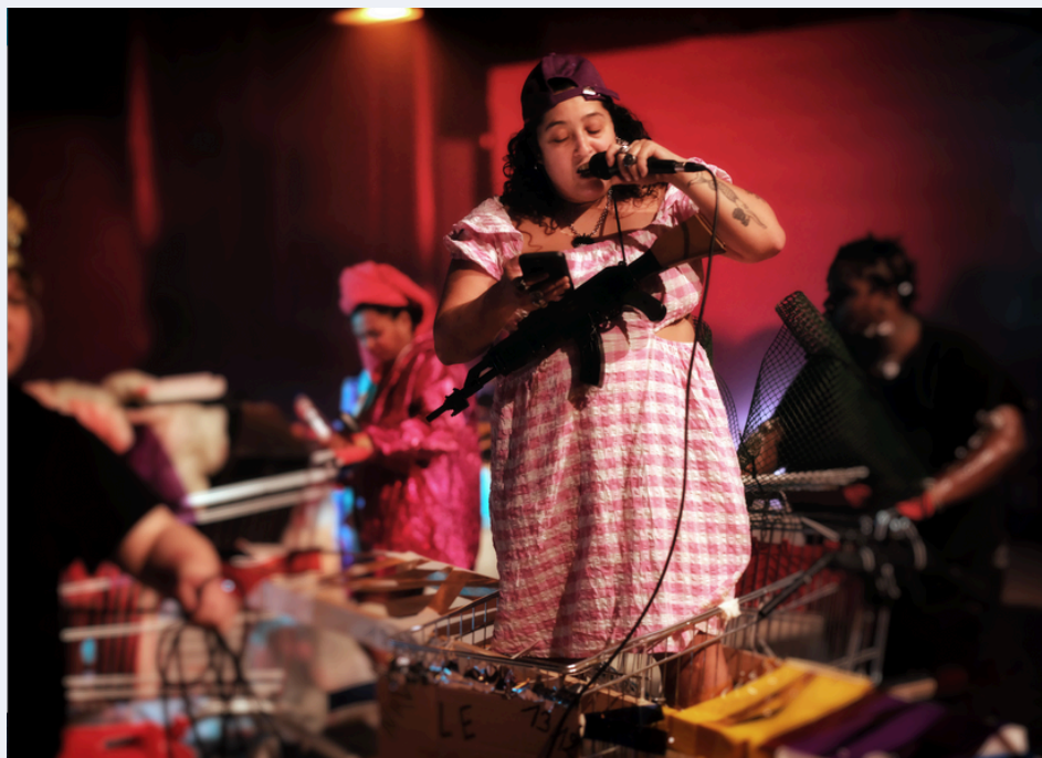
Residency at TPM - Théâtre Public Montreuil, December 2025

When I staged Carte noire nommée désir , I wanted to politicize the personal without doing documentary, I wanted to use theater to create images that didn't exist, an imaginary world of which racialized people could be proud, but without denying the violence that allowed us to arrive at these representations. This produced a nonlinear, non-narrative aesthetic, which was my way of moving toward the future, toward the fantastic. In my next show, I'd like to dig in to my love of fiction, which was born among other things of the discovery of works of science fiction written by African American and Afro-British women and trans folks like Nnedi Okorafor, Octavia Butler, Rivers Solomon, and Ketty Steward... This will most likely lead me to new aesthetic explorations.