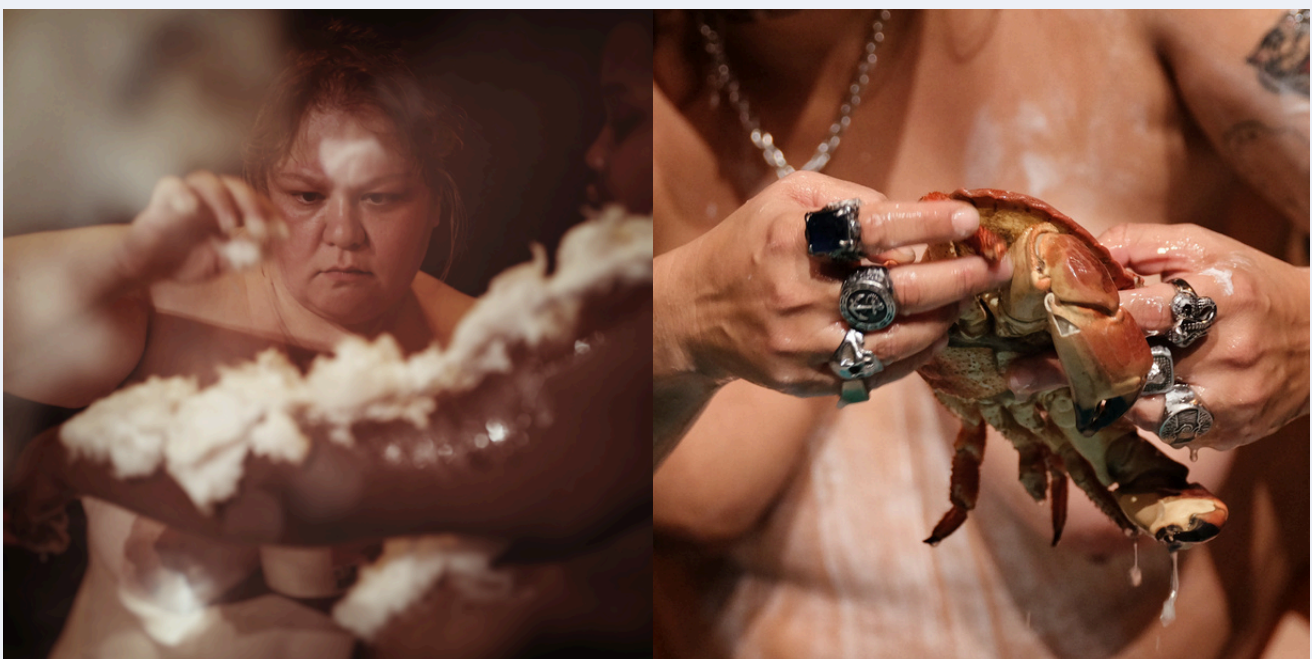
Residency at TPM - Théâtre Public Montreuil, December 2025