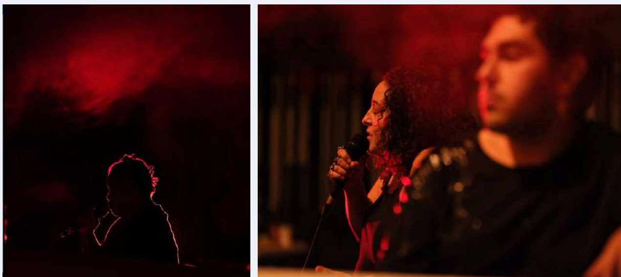
Residency at TPM - Théâtre Public Montreuil, December 2025 ©Marikel Lahana

Perhaps we'll find the very poetic-performative means to prevent our sky, our dreams, and our religions from being colonized.