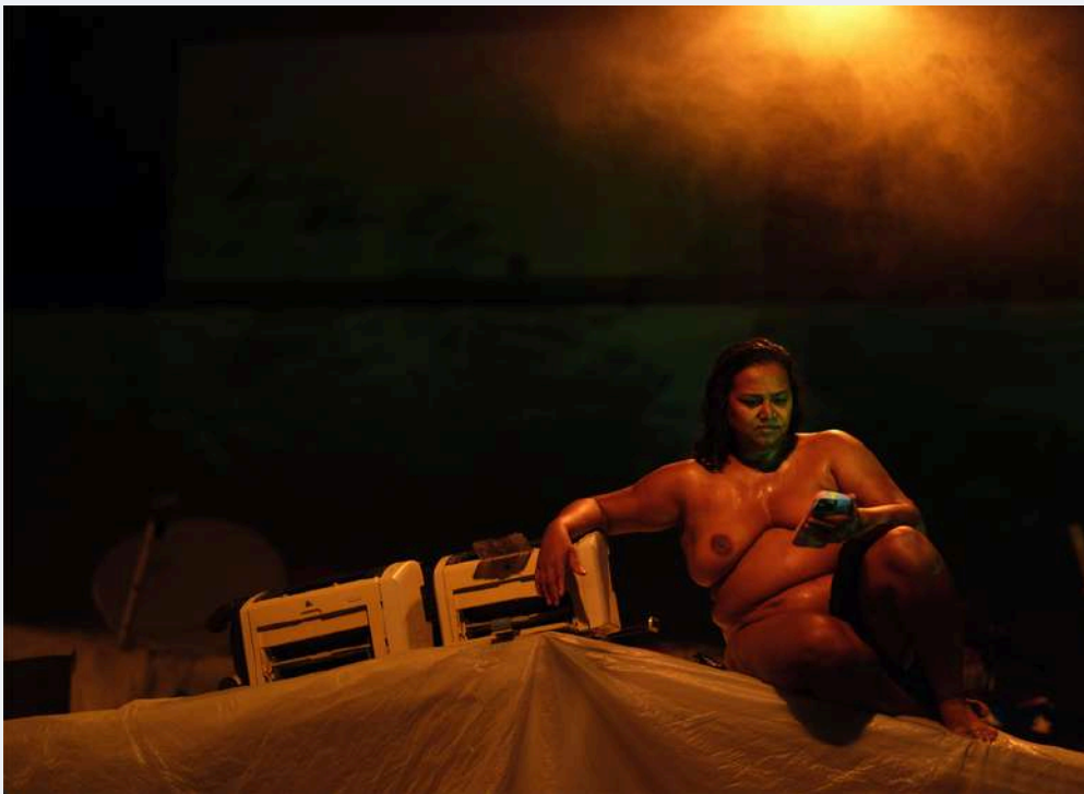
Residency at TPM - Théâtre Public Montreuil, December 2025