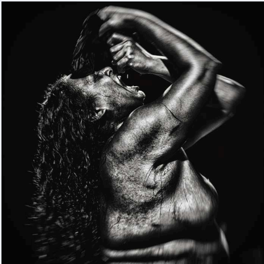
Residency at TPM - Théâtre Public Montreuil, December 2025