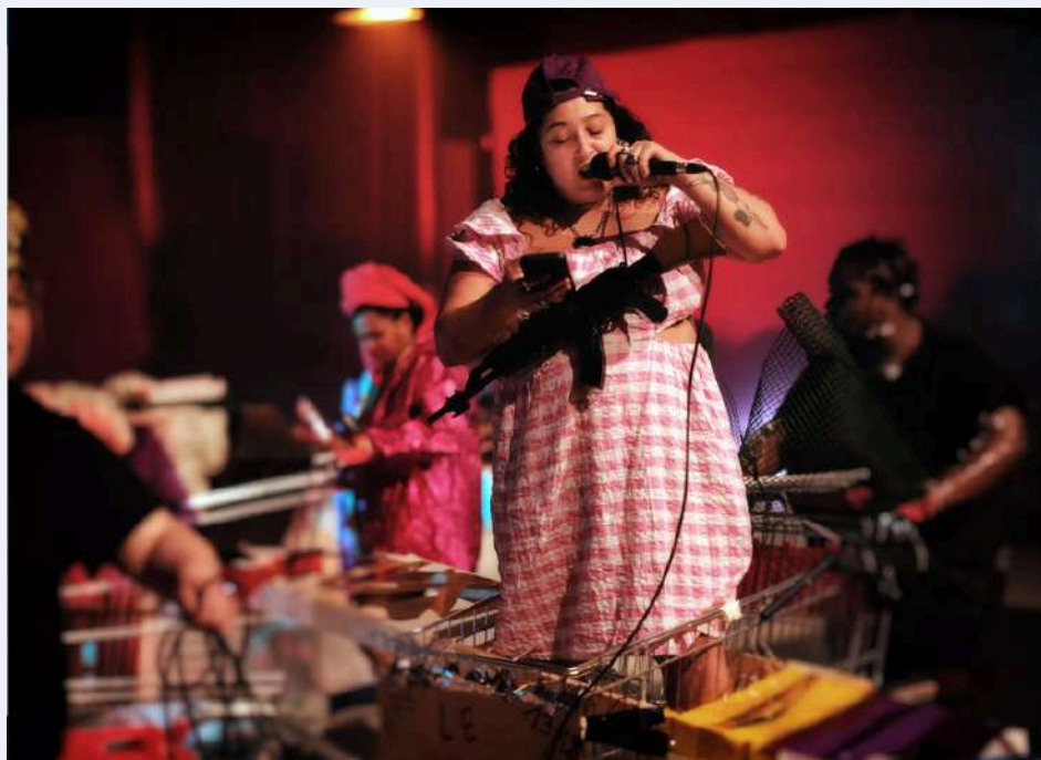
Residency at TPM - Théâtre Public Montreuil, December 2025

When I staged Carte noire nommée désir , I wanted to politicize the personal without doing documentary, I wanted to use theater to create images that didn't exist, an imaginary world of which racialized people could be proud, but without denying the violence that allowed us to arrive at these representations. This produced a nonlinear, non-narrative aesthetic, which was my way of moving toward the future, toward the fantastic. In my next show, I'd like to dig in to my love of fiction, which was born among other things of the discovery of works of science fiction written by African American and Afro-British women and trans folks like Nnedi Okorafor, Octavia Butler, Rivers Solomon, and Ketty Steward... Without imagining that it will be an entirely fictional show, I have a feeling that it will undoubtedly lead me to new aesthetic explorations.