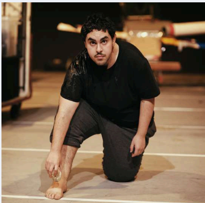
Residency at TPM - Théâtre Public Montreuil, December 2025

*Note on the french title La Parabole du seum [Parable of the sour]: In French, the word “parabole” means both “parable” and “satellite dish.” “Seum” is a French slang word said to derive from the Arabic word for “venom.” It is used to express feelings of anger, frustration, and bitterness. The title La Parabole du Seum also refers to Octavia Butler’s novel «Parable of the Sower», which is published in French as «La Parabole du Semeur» (note that “semeur” is very close phonetically to “seum”).