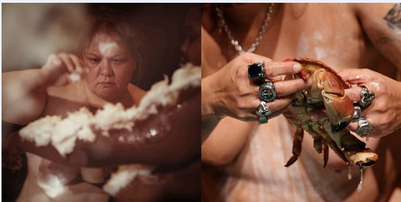
Residency at TPM - Théâtre Public Montreuil, December 2025