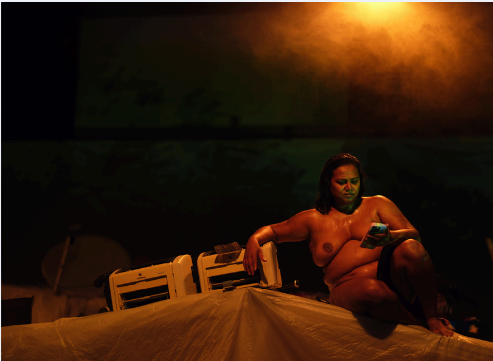
Residency at TPM - Théâtre Public Montreuil, December 2025