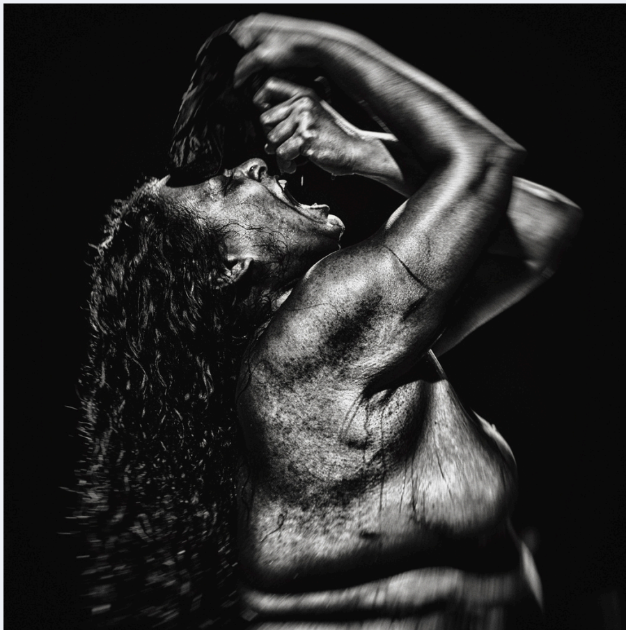
Residency at TPM - Théâtre Public Montreuil, December 2025

On tour on Summer 2026 and season 2026-2027.