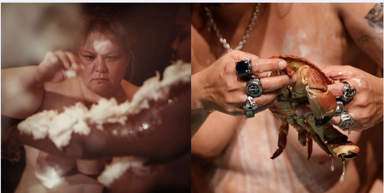
Residency at TPM - Théâtre Public Montreuil, December 2025