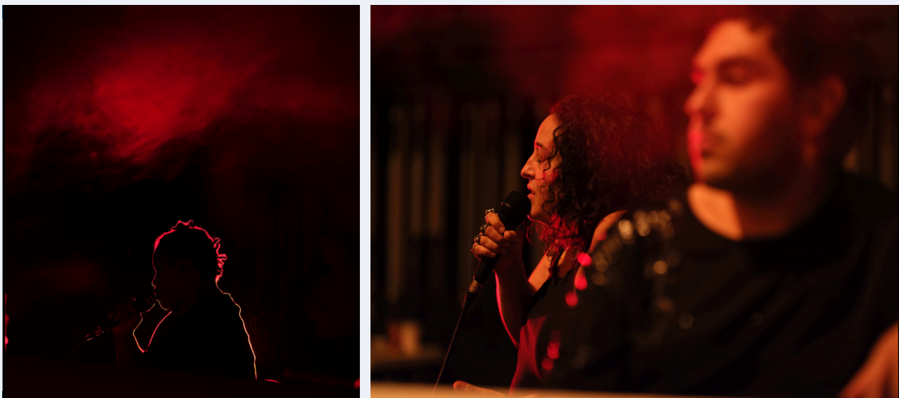
Residency at TPM - Théâtre Public Montreuil, December 2025

Perhaps we'll find the very poetic-performative means to prevent our sky, our dreams, and our religions from being colonized.