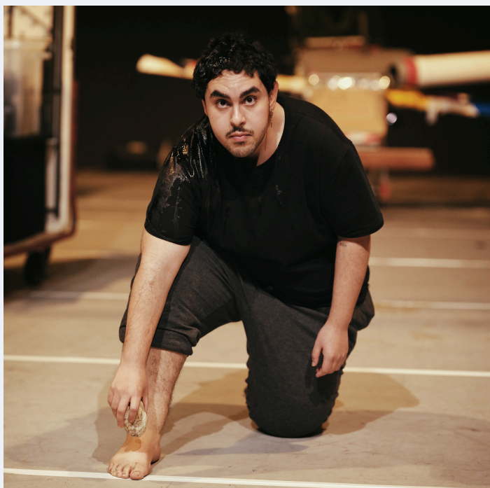
Residency at TPM - Théâtre Public Montreuil, December 2025

*Note on the french title La Parabole du seum [Parable of the sour] : In French, the word “parabole” means both “parable” and “satellite dish.” “Seum” is a French slang word said to derive from the Arabic word for “venom.” It is used to express feelings of anger, frustration, and bitterness. The title La Parabole du seum also refers to Octavia Butler’s novel «Parable of the Sower», which is published in French as «La Parabole du Semeur» (note that “semeur” is very close phonetically to “seum”).