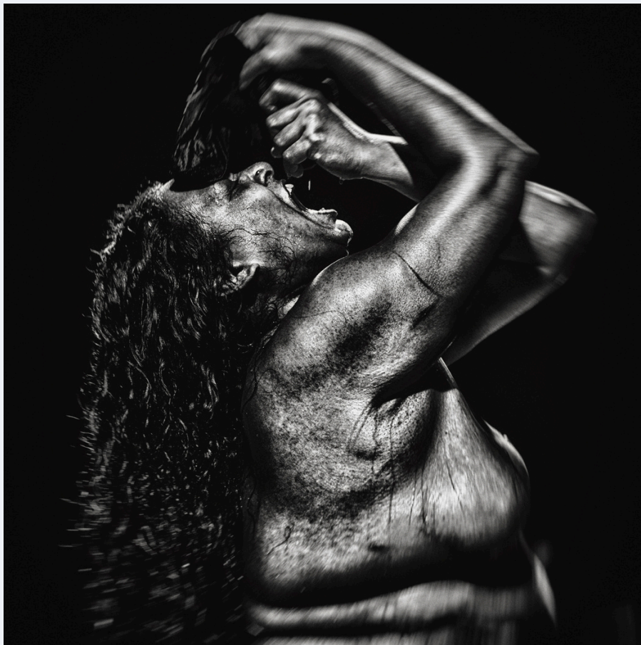
Residency at TPM - Théâtre Public Montreuil, December 2025

On tour on Summer 2026 and season 2026-2027.